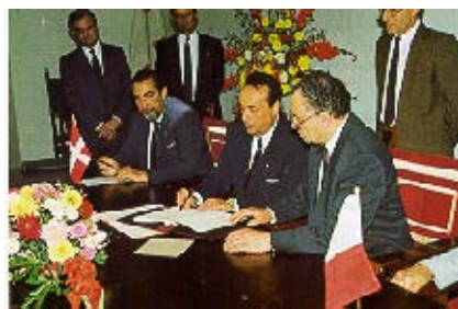
Signing the agreement between the Order and the Republic of Malta at Fort St. Angelo (21 June, 1991).

Good results were also achieved in other European countries with respect to re-organization. All the ancient Langues were abolished in an attempt to renew the Order's peripheral structures and the National Associations of Knights were created. The first to be founded was the German one in 1859, followed in 1875 and 1877 by the British and Italian ones respectively. The will and commitment of the Order, shown at times in which ideals of chivalry were no longer particularly popular, led the Pope, Leo XIII, to satisfy the desire of the Knights of St. John to choose their own Grand Master, a charge which had been vacant since 1805. On March 28th, 1879 the Pope signed a Bull authorising the election and the then reigning Lieutenant Fra' Giovanni Battista Ceschi a Santa Croce was called to this highest position within the Order.