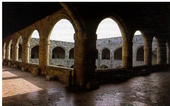
The Hospital of Rhodes, built by Grand Master Fra' Jean de Lastic.

Though Europe could postpone the solution to the problems of the inherited Kingdom d'outremer, a very uncertain period began for the Military Orders. With the impossibility to develop their own institutional activity, they felt that the reasons for which they had been founded were lacking. The war against the infidels, the original reason for which the Religious Orders had been founded, was failing.