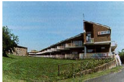
Wing of the St. John the Baptist Hospital at Magliana (Rome).