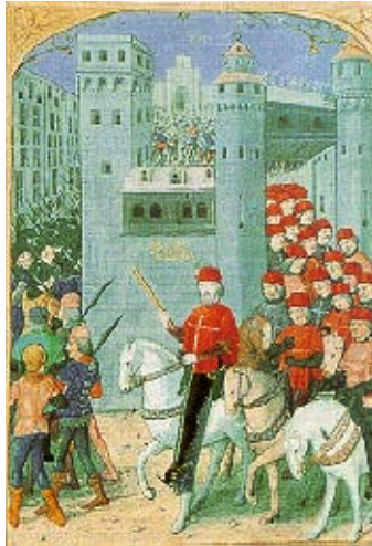
The Siege of Rhodes: Fra' Pierre d'Aubusson pays homage to Our Lady of Philermo, Protector of the Order.

The Turkish ships attacked Chio in 1319 and Rhodes in 1320. In both cases the forces of St. John were inferior, but the enemy was rejected and most of their ships were captured.