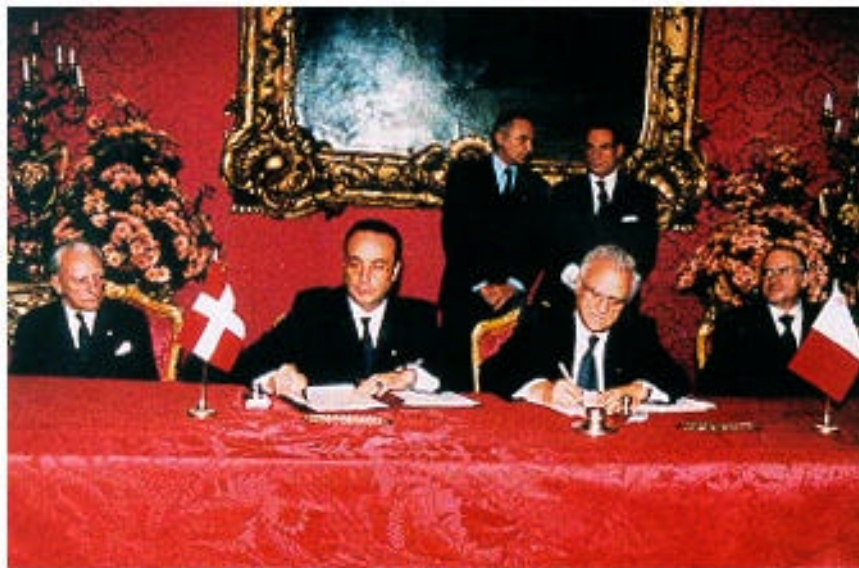
Valletta, Malta. Signing the new agreement between the Order and the Republic of Malta on Fort St. Angelo.

The admission of the Order to the United Nations has increased the number of its bilateral relations with other states up to 83. The National Associations are now 42 but what is most amazing is the multiplication of the international missions of the Order in the humanitarian field.