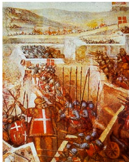
Gran Master Fra' Jean de La Vallette exhorting his Knights on the ramparts of Malta.

From the first months of their stay they worked incessantly and even though, from a strategic point of view, the island had a position of great value, however much effort they exerted they could not fortify it completely.