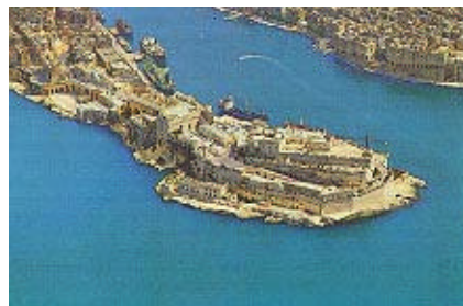
View of Fort St. Angelo, centre of Malta's defensive system.

As he scanned the horizon from Fort St. Elmo the old Grand Master remembered the suffering and the humility, but the victories too, all in the name of the "Sacra Milizia".