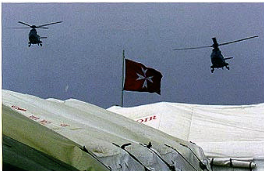
Albania, May 1999: The Order of Malta's Flag flies over a field hospital set up by its international bodies.