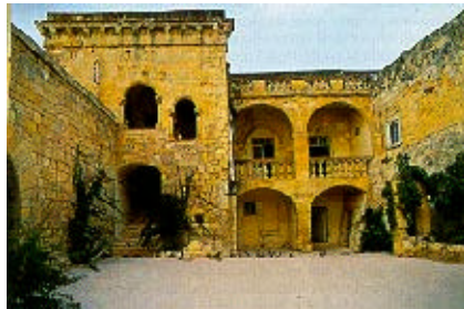
Palace from where Fra' Jean de La Vallette conducted the various phases of the long Siege.

It would take too long to list the innumerable acts of heroism of the Hospitallers and Maltese during the endless months of siege. Their determination and courage contributed towards saving Christianity and western civilisation. Men coming from different nations, gave an example of how important faith, together with a common ideal, was to a divided and uncertain Europe. The Siege of Malta was not just another of the many battles fought between Muslims and Christians. The military prestige of the two sides was at stake in this decisive duel between the Cross and the Crescent.